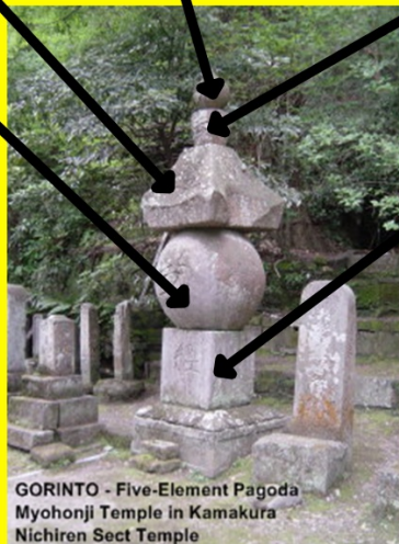
GORINTO - Five-Element Pagoda Myohonji Temple in Kamakura Nichiren Sect Temple

These Pogodas are often built by the Vihara to represent the five elements.