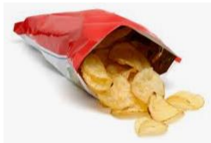
A packet of crisps in case she gets peckish.