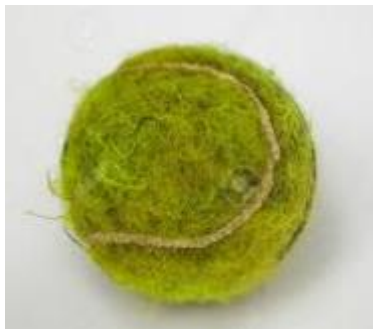
An old tennis ball for the corgis.