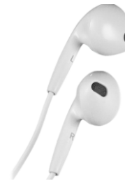
Headphones, in case people's speeches get boring.