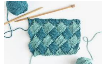
Knitting, in case she gets bored.