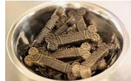
Dog biscuits - chewed or otherwise..

I'd quite like her to have some other things in there.