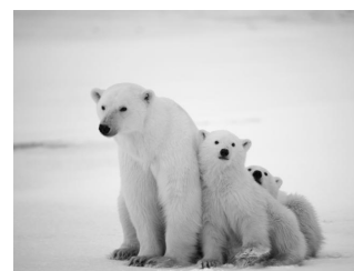
A polar bear and its cubs.

Polar bears live in countries around the Arctic: Canada, Russia, the United States, Greenland and Norway. In the winter, temperatures in the Arctic are usually around minus 29 degrees. In the summer, polar bears live on the land. In the winter they live on the ice.