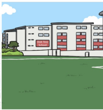
O ak T ree S chool