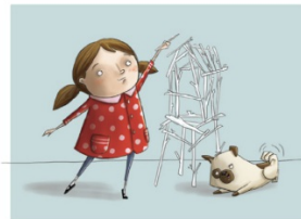
She makes things.