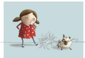
He unmakes things.